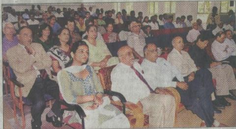
गोल्डन जुबली उत्सव के दौरान आयोजित वर्कशॉप में उपस्थित वैज्ञानिक